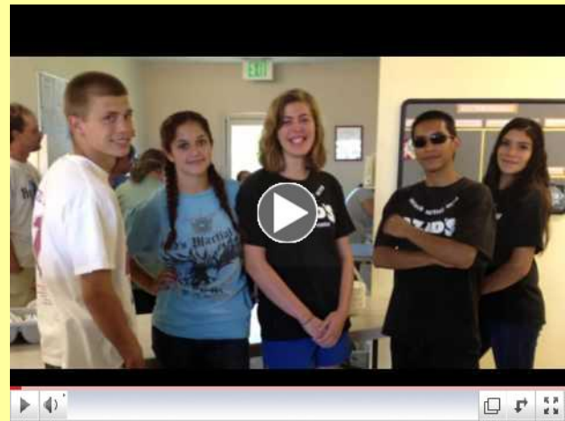
Rock Solid Teen Chico