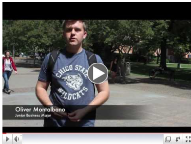
Students speak out