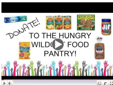
Pack the Pantry