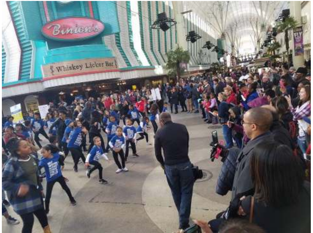
Culture Shock Las Vegas, Fremont Street Experience Event