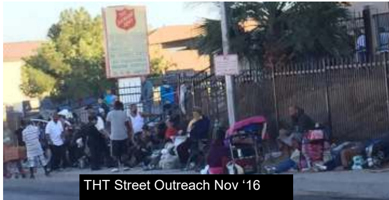
THT Street Outreach Nov '16