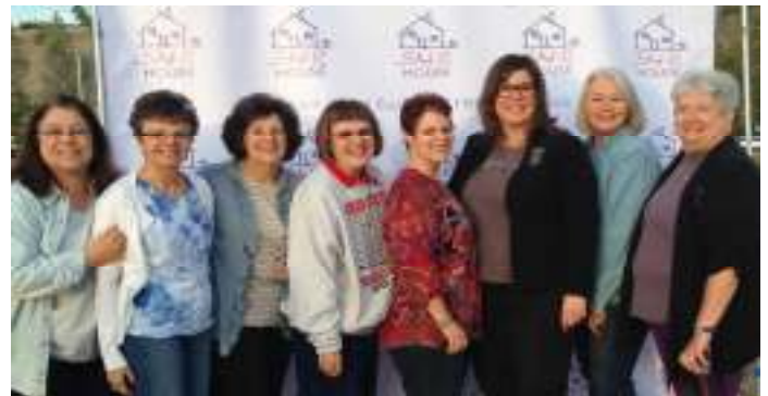
On October 8, members and friends volunteered at the SAFE House NV's 8th Annual Run for Shelter to help raise funds and awareness of domestic and intimate partner violence. We hosted a water station, helped with registration and helped make sure runners/walkers were staying on course.